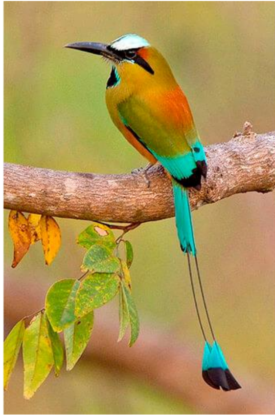
Guardabarranco – National bird of Nicaragua