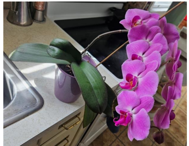
Orchid at Wegter-McNelly's home