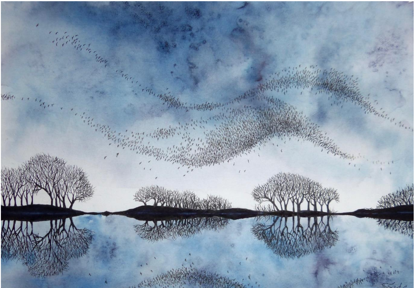
Ripple of Starlings II, By Sue Side